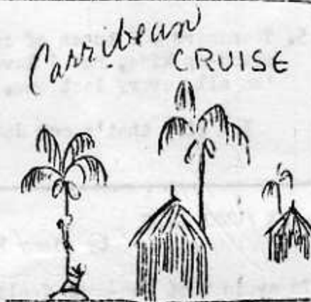
HOUSE SOCIETY FAVORS

The favor committee has chosen some real cute favors for us.